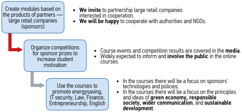
Figure 4 — Post-project sustainability ideas

Thus, for the further development of educational activities and improvement of distance education, Belarusian universities are advised to continue the implementation of the best practices of universities in developed countries, to intensify networking and to promote the principles and ideas of Life Long Learning, to actively involve government bodies, business, NGOs, local communities in these processes.