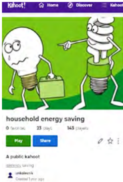
Figure 2 — E-Quiz of the Energy Saving course

presentation, methods of studying and subsequent solution of complex or tricky problems are used. These methods are aimed at detailed presentation of the problems (Rich Pictures), as well as a detailed description of the structure of the system (System Maps). The use of the Rich Pictures methodology made it possible to present students with an interactive, simple and understandable curriculum for a blended LLL course “Household Energy Saving” (Figure 3).