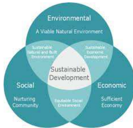
Figure 1 – The Three-pronged Concept of Sustainable Development

The principle of Sustainable development has also been adopted by the Republic of Belarus: according to the National Strategy for Sustainable Development until 2030 (NSSD 2030), the three above-mentioned components - economic, environmental and social - should be in harmony with each other.