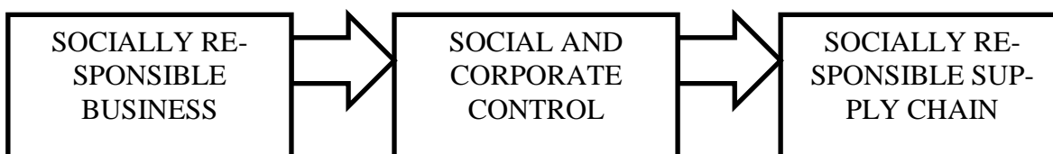
Figure – 1 Evolution of the concept of corporate social responsibility and social direction of responsibility in the supply chain

The term "sustainable" in the context of the supply chain can be understood as achieving a state of equilibrium that provides a balance between individual positions in the final balance of the enterprise. However, the most common is the definition according to which sustainability is understood as "development that meets the needs of the present without compromising the ability of future generations to meet their needs" [5]. The evolution of the concept of corporate social responsibility and the direction of social responsibility in the supply chain is shown in Figure 1.