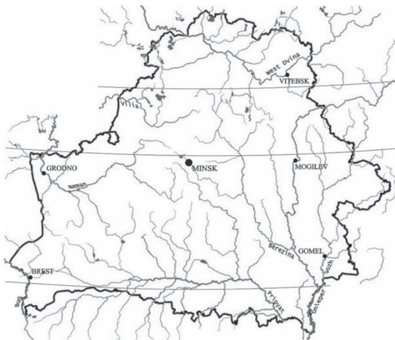
Fig. 1. The hydrographical map of Belarus

Belarus currently has 20781 rivers, about 11 thousand lakes, 153 water basins, and 1306 small basins, and also 19 state fish farms. The total length of the rivers is 90631 km. However, 19291 of the rivers (about 80%) are the small rivers with length less than 10 km. The mean density of the river network is 0.44 km/km 2 . Maximum values are typical for the North of the country, where this value is 0.60-0.80 km/km 2 . The minimum value of 0.23 and 0.30 km/km 2 is observed in the South of Belarus. About 45% of Belarusian rivers are the rivers of the Baltic Sea basin, and 55% are the rivers of the Black Sea basin. The hydrographical map of Belarus is presented in Figure 1