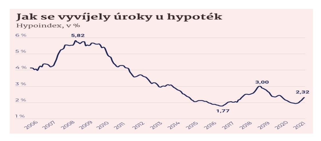
Figure 3 – Mortgage interest rate index [13]

Similar situation is with loans from building societies. In 2020, they provided loans in the amount of 65 billion kronor, which is 36% more than in 2019. The current pandemic situation has not affected the market, which is perhaps surprising. People now perceive housing as a safe haven and protect their savings, so interest in housing loans has increased dramatically [11].