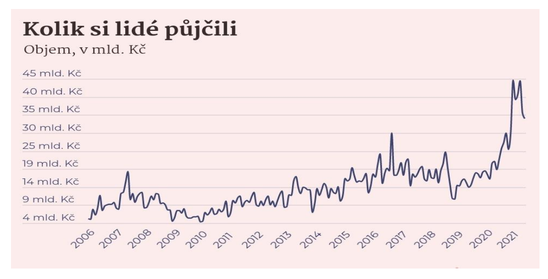
Figure 2 – Volume of mortgags issued (on the graph, the digital column on the left must be multiplied by 10) [10]